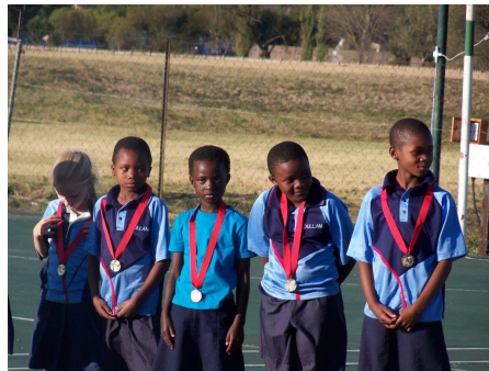
The girls getting some medals for netball