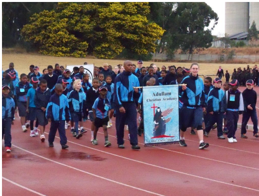
Adullam Christian Academy doing the march at the Regional Athletics