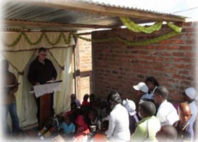
Pastor taking a service in Zimbabwe

Ons is dankbaar dat die Here ons gedra het oor al die kilometers (3600 km) sonder teenspoed. Bid asb saam dat die Here se seen op die werk sal rus en dat sy Woord nie leeg sal terugkeer nie.