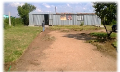
Adullam's Drop-in-Centre and Crèche in Embalenhle

Train up a child in the way he should go and when he is old he will not depart from it.