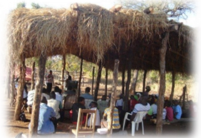
The church building in Mozambique