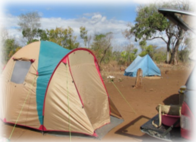
Camping in Zimbabwe