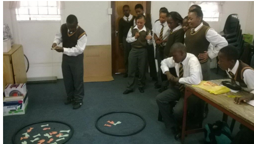
One of the lessons Thomas taught during LCC Training