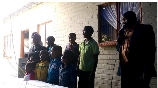
Children singing during the Sunday morning service