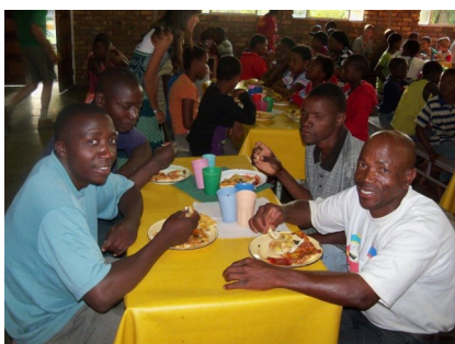
Some men enjoying the pizza