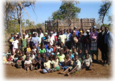
The group that came for the services in Mozambique