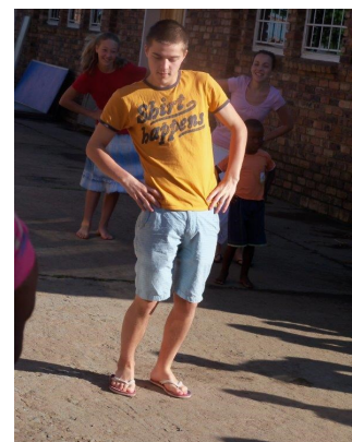
Early morning exercises with the kiddies