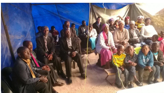
Sunday Morning service in Bethal