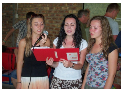
Russian ladies blessed us with songs