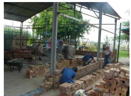
The erecting of the walls