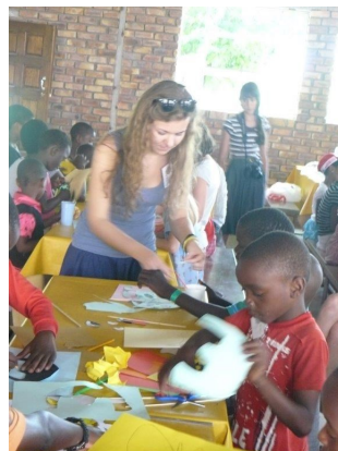
A Russian lady doing an activity with the kids