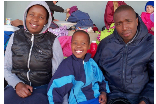
Parents enjoying a day of sport with the school