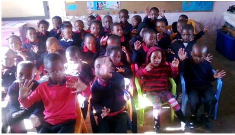
Vumelani Mission School in Leslie

In Leslie we are still struggling to get a suitable stand. We are currently using facilities to run the school, that needs serious attention. We would really like to upgrade the facilities in Leslie, but feel it is not wise to do so if the ground is not the property of Adullam.